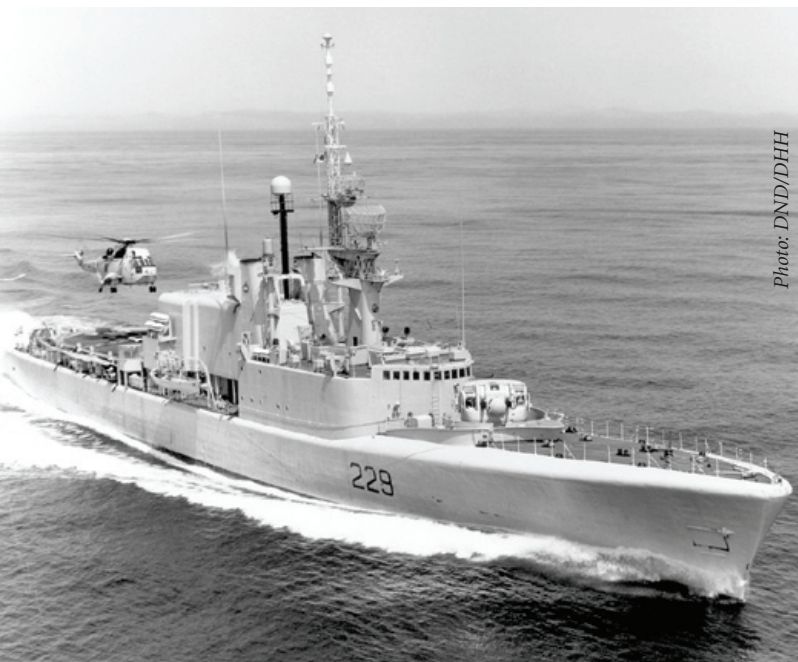
The future of naval aviation in the RCN, the helicopter-carrying destroyer (DDH), HMCS Ottawa.