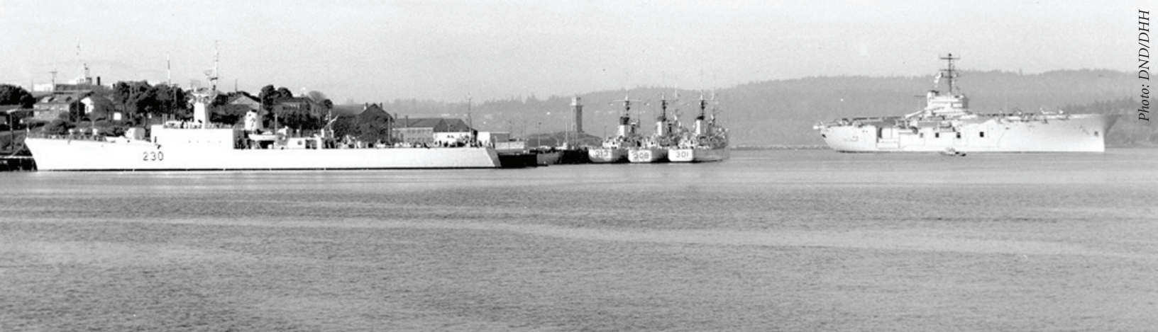
With HMCS Margaree and three Prestonian -class frigates in the foreground, USS Iwo Jima arrives for a port visit to Esquimalt, BC, on 4 November 1961. Some officers wanted to make the image of a Canadian Iwo Jima rounding Duntze Head a reality.

level of firepower or sophistication. Only a Korean War type of scenario could justify the Essex and Iwo Jimas and even a cursory reading of the new Liberal government suggested that it did not want Canadians involved in international conflicts and potential quagmires. That meant Canadian peacekeepers would disembark through unopposed port landings, and according to Rayner the current fleet could easily cope with this type of sea lift.